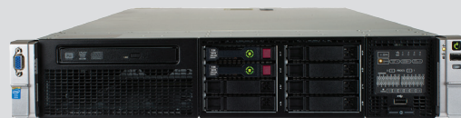
MOTOTRBO Anywhere Server

All specifications subject to change without notice 07/14 Version 4