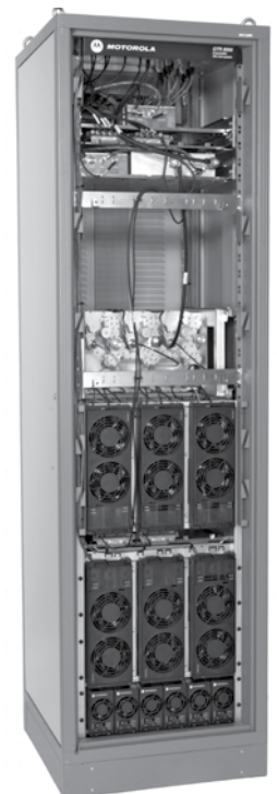
GTR 8000 Expandable Site Subsystem

Designed to carry your needs into the future, the G-series hardware platform has built-in functionality and flexibility with an AC/DC - 48VDC power supply and two-branch receive diversity capacity, as well as a linear power amplifier for improved coverage in P25 FDMA Simulcast systems.